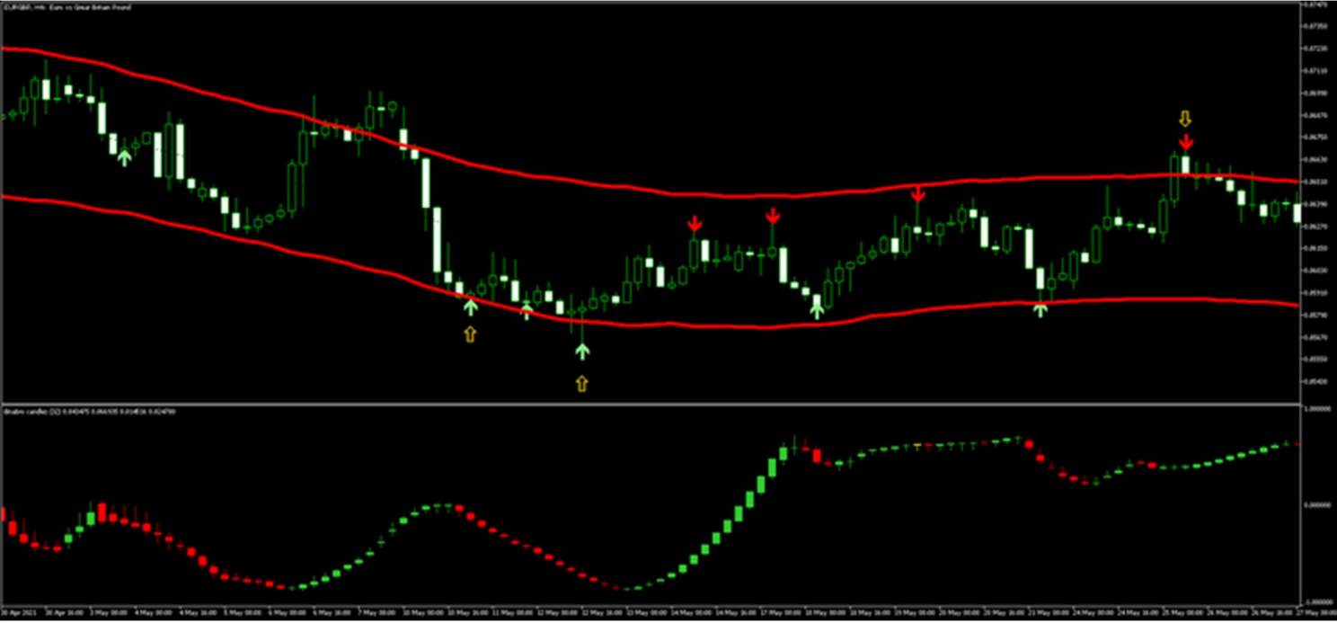
Reversal Trend Arrow MT5