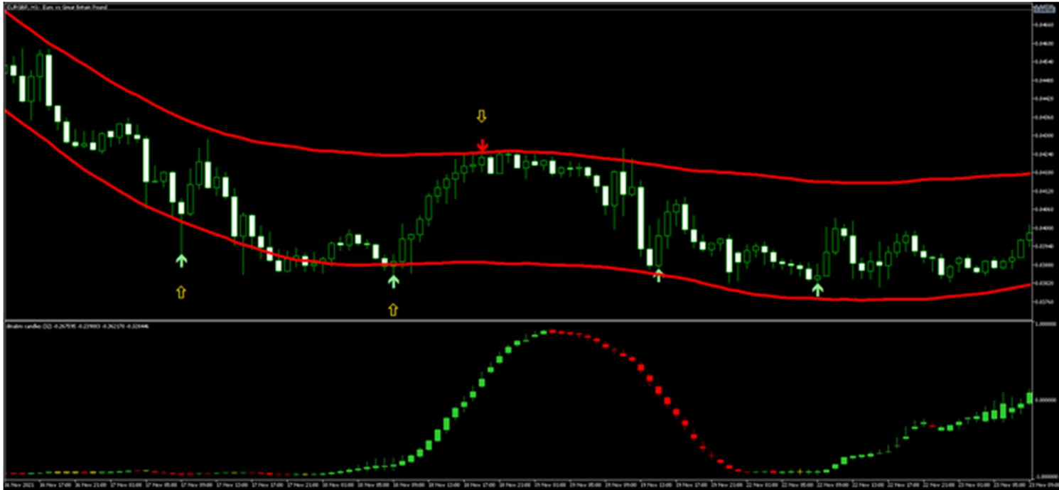
Reversal Trend Arrow MT5