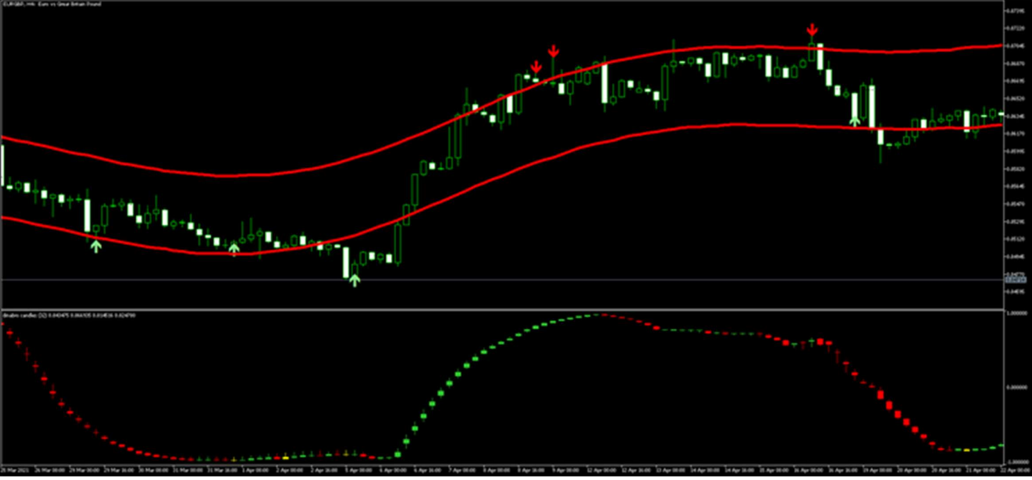
Reversal Trend Arrow MT5