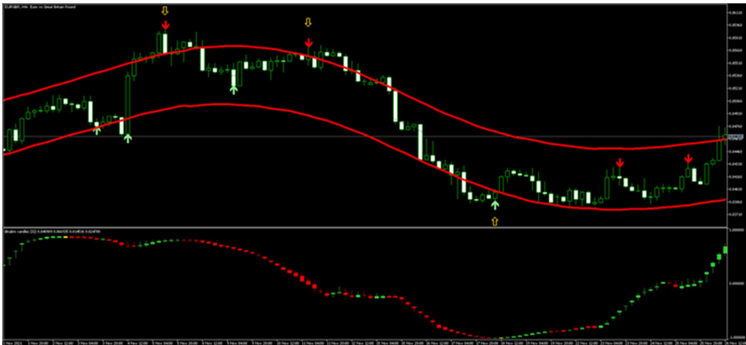
Reversal Trend Arrow MT5